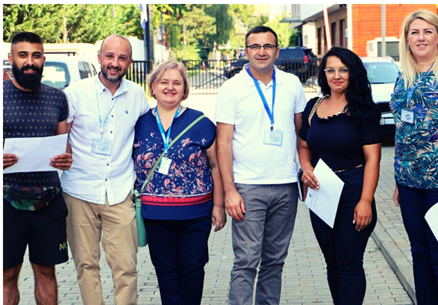
Stateless persons upon delivery of positive decisions (supported by MIA/DCAM, UNHCR & CRP/K).

UNHCR and partner organization CRP/K continue to provide legal aid to vulnerable persons UNHCR cares for to enable initiation of relevant procedures under the auspices of the #Ibelong campaign.